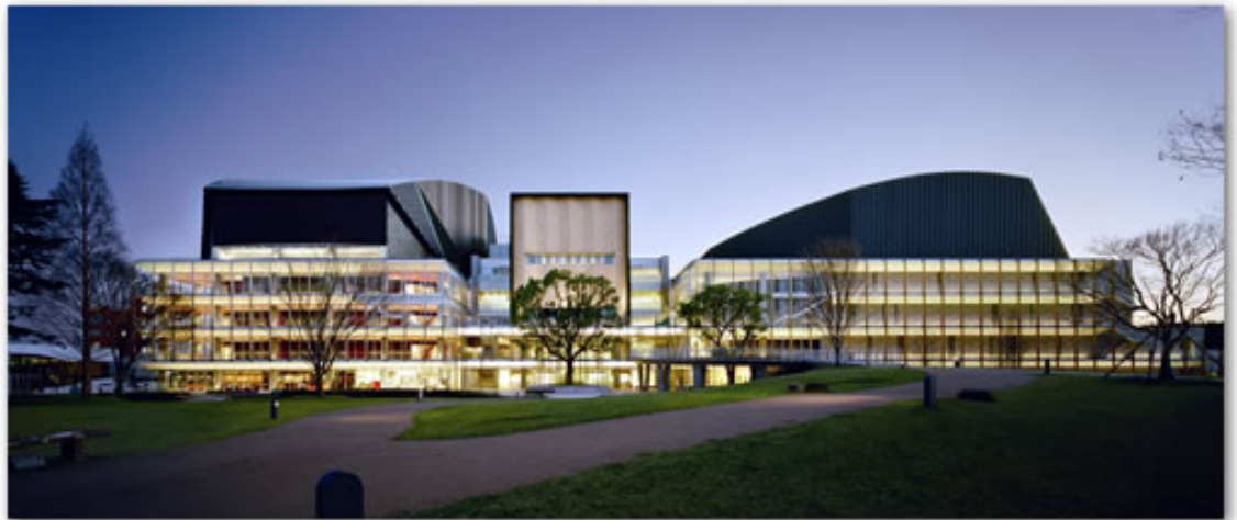
Iwaki Performing Arts Center Fukushima, Japan