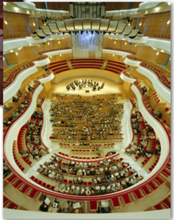
Renée and Henry Segerstrom Concert Hall and Sameuli Theater Orange County, California