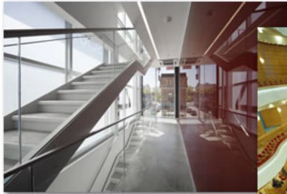
Theatre De Quat'sous Montreal, Canada