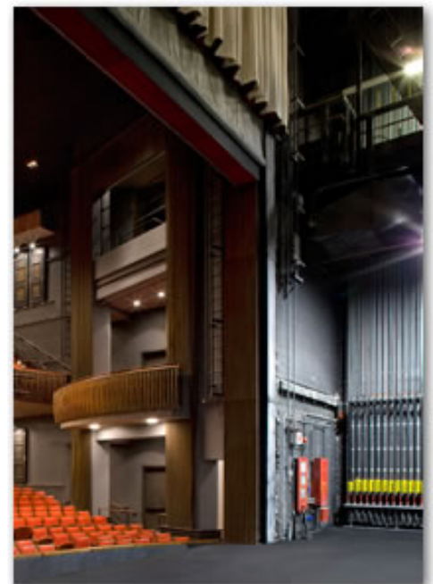
Henry Miller's Theatre New York, New York