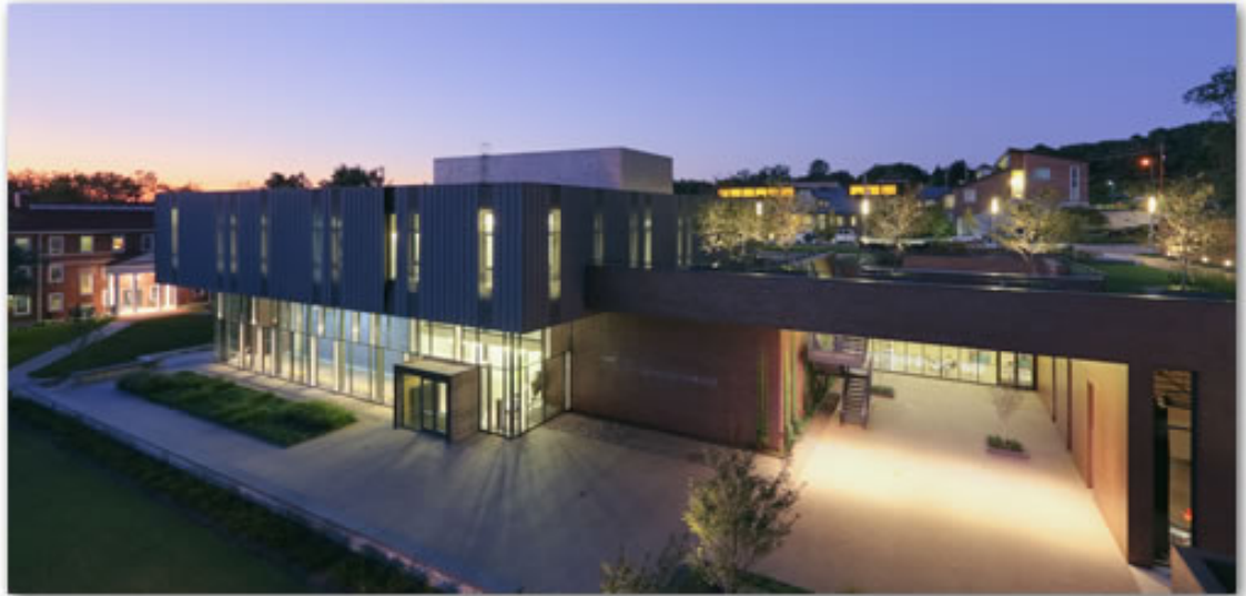
Vukovich Center for Communication Arts Allegheny College, Meadville, Pennsylvania;