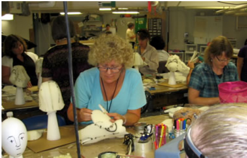
Symposium participants experiment with half-scale donkey patterns in foam.

The remainder of the afternoon was allotted to lab work. Many participants used this time to finish projects, ask questions, or focus on a particular challenge. All of the symposium mentors were on hand to answer questions and offer help. The day ended in a casual "show and tell," giving each attendee the opportunity to comment on the work they had accomplished and to get feedback from the group, followed by a pack-out session for those who needed to ship their creations home.