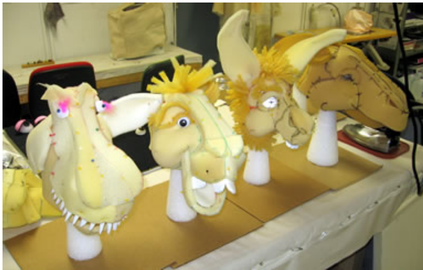
Variations on the basic donkey pattern: T-rex, braying ass, cartoonish donkey, natural donkey.

Attendees divided the rest of the afternoon between the two projects, working on creations with the help of mentors and alumni volunteers. The Ohio team led attendees through relatively challenging projects with ease and encouragement. Many of the participants chose to return after dinner for an additional, optional, supervised work session.