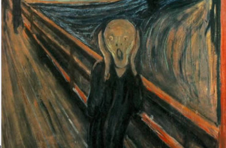
The Scream by Edvard Munch, 1893