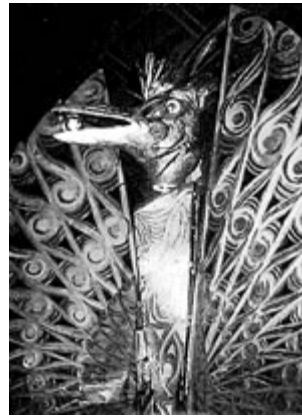
The Raven, designed by Ali Pretty for Flight , Notting Hill Carnival 1999.

representative cultural strategies that colonized people employed in carnival. Much of Carnival's nature, both as popular Caribbean celebration and resistance art, derives from the historic situation of colonization and slavery and the social and political relations inherent in it.