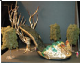
exhibit including a series of concept shoe designs from Carnegie Mellon University. The project brief asked for the materials and design elements to express an idea through the medium of shoes.

The Architecture Exhibit highlights 17 performance spaces for the next generation focusing on training facilities for universities and colleges, professional theatres, and performing arts facilities. A photo-montage was created to show the unique features of each along with an accompanying DVD for additional details. Two projects emerged as featured designs: the Class of '62 Center for Theatre and Dance, (right) Williams College, Williamstown, Massachusetts (Architect William Rawn Associates), and the Richard B. Fisher Center for the Performing Arts, Bard College, Annandale-on-Hudson, New York (Architect Gehry Partners, LLP). Both were seen as projects of outstanding architectural distinction containing exciting theatre spaces and providing a stimulating educational environment.