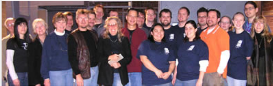
Team PQ 2007, pictured above, stopped work briefly during the recent setup weekend.