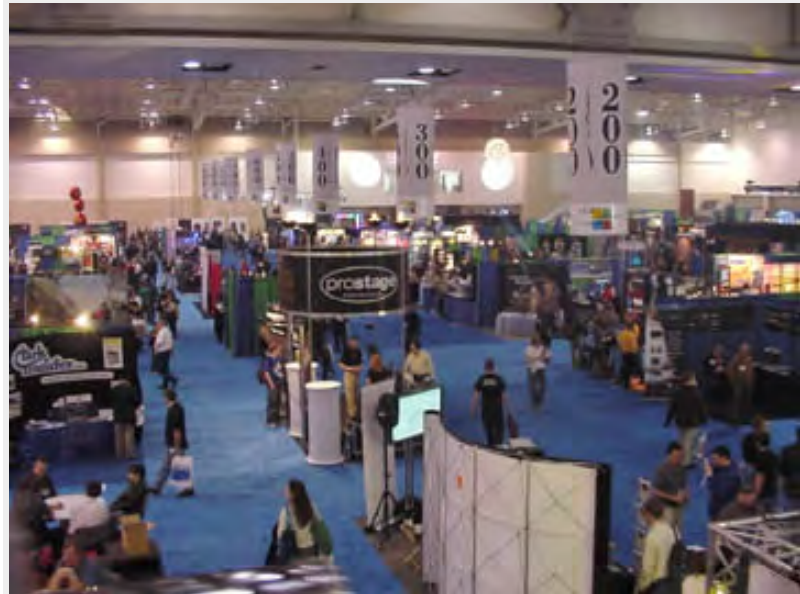
Already Booked for Stage Expo 2007

For the past several years, each Stage Expo