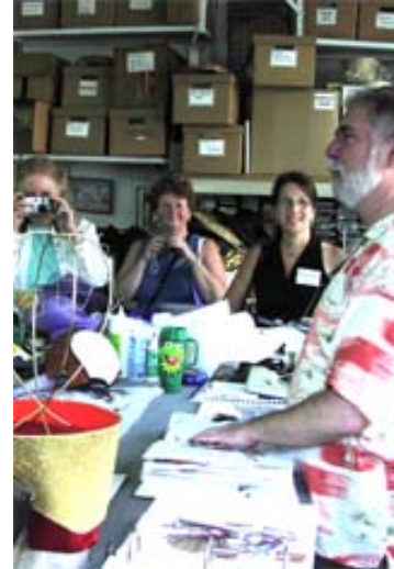
A visit to Arnold Levine Crafts was just one stop on one tour for those taking part in the 2006 Costume Symposium held this August in New York City.

The symposium also included sessions on how to use the city's resources. The panel on Shopping and Researching featured panelists who make their living shopping and finding the perfect fabric or accessory. Symposium participants were able to grill the pros on the best places to find a wide variety of specific items. A panel on using the city for training students had a variety of panelists discussing how their particular institution took advantage of the city to set up internships in shops, shop for shows, obtain