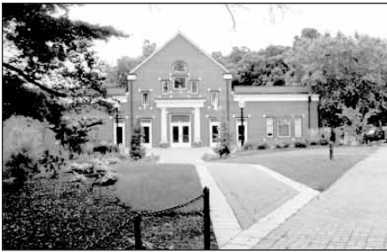
The Woodard Campus Center at Mary Washington College will be the site for Costume Symposium sessions.

Travel to historic Mary Washington College in beautiful Fredericksburg, Virginia for an intensive three-day program designed to strengthen participants' teaching methods in costume curriculums. For each costume subject area, participants will develop or strengthen teaching strategies used to meet the specific challenges of technology in an academic environment.