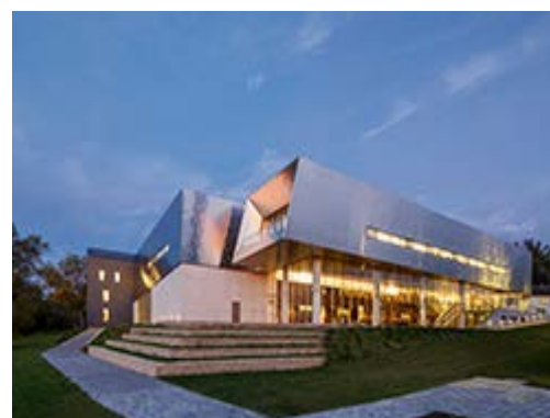
The Isabel Bader Centre for the Performing Arts at Queen's University

The Isabel Bader Centre for the Performing Arts at Queen's University , designed by Snøhetta at a total cost of $72 M, is a catalyst for the arts at the University. An 80,000 square-foot building unites a diverse range of the University's performance and creative art disciplines under a single roof. With a 566-seat performance hall, classrooms, rehearsal and performance spaces, the Isabel provides a supportive learning environment for young artists and performers to grow in their discipline.