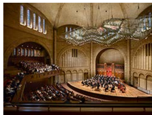
The Maltz Performing Arts Center

The Maltz Performing Arts Center , designed by MGA Partners Architects is a nationally registered historic synagogue in Cleveland, Ohio at the performing arts center for Case Western Reserve University. The renovations included the addition of an acoustic canopy, theatrical lighting, a stage and piano lift, acoustic wall panels, as well as restored seating and interior finishes. In addition, a chapel in the rear of the building was converted into a recital hall, and support spaces such as a green room and control rooms were added.