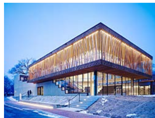
Writers Theatre.

intimacy and the close audience-performer connection found in their original smaller spaces. The design team realized this goal by working collaboratively to create new, technologically advanced performance spaces that are still reminiscent of the theater's former venues. While the size of each venue was effectively doubled, they remain as intimate and immersive as Writers' original spaces.