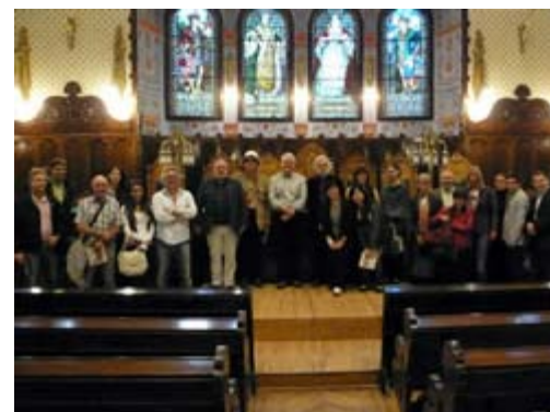
During OISTAT's Executive Committee meeting in Serbia, the group toured City Hall.

The Second International Lighting Design Symposium, hosted jointly by the OISTAT Lighting Design Working Group and the China Center for Theatre Arts was scheduled for April 2 to 6 in Hangzhou, China. Five