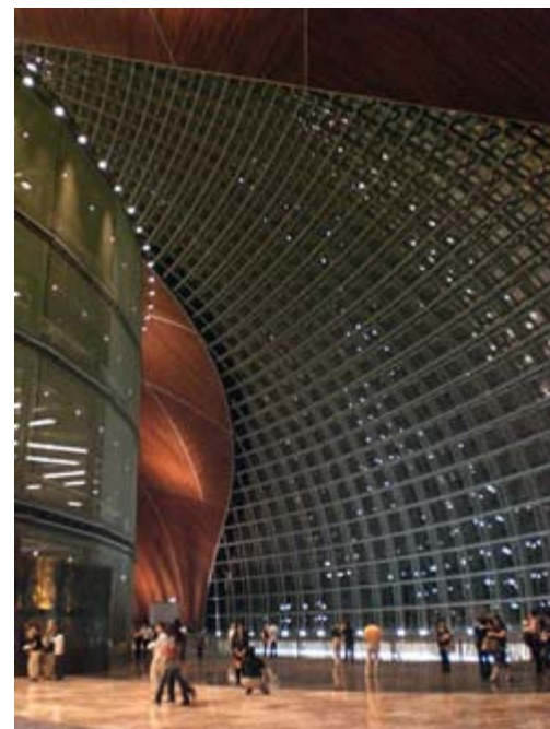
Inside the National Theatre in Beijing.