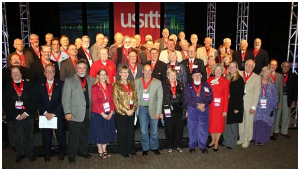
Current USITT Fellows gathered during the 2010 Annual Conference & Stage Expo in Kansas City in March 2010.