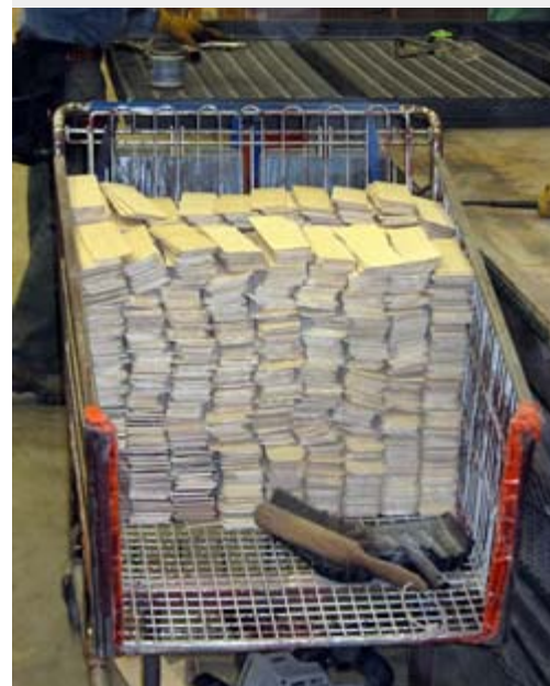
Some of the bricks.

So even though all those bricks were cut out by hand, and are being textured in what must certainly be the slowest process on earth, the students keep coming, and they keep smiling – with or without donuts.